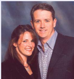
Tara & Steven Merson Young Leaders Award

SAVE THE DATE! YJCC SPRING SOIREE MAY 12, 2010